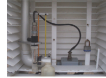
Thermometer in a shelter. (Hakim & Patoux. 2018).