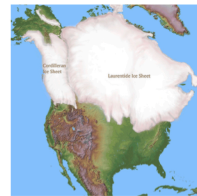
Glacial maximum 15,000 years ago